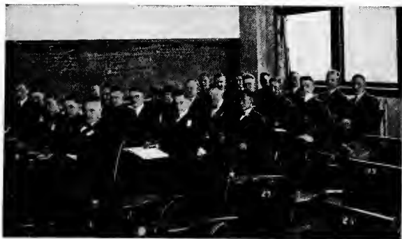
A CLASS IN RURAL LEADERSHIP AT A STATE AGRICULTURAL COLLEGE

Study of scientific methods and farm economics will not suffice. These men must take the lead in establishing a healthy social and religious life in these communities. The Association is established in all of these colleges, and its program is projected with this broad objective, and with the hearty support of the college faculties.